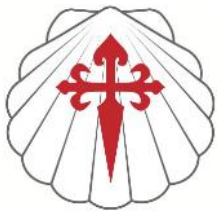
Pilgrim shell with Cross of St. James the Greater

St. James the Greater. Pray for us on our pilgrimage of Lent.