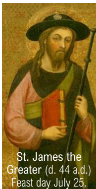
St. James the Greater (d. 44 a.d.) Feast day July 25.