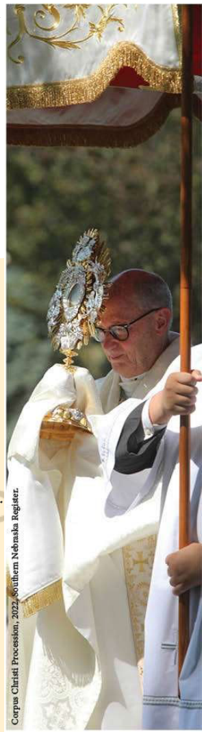
Corpus Christi Procession, 2022, Southern Nebraska Register.