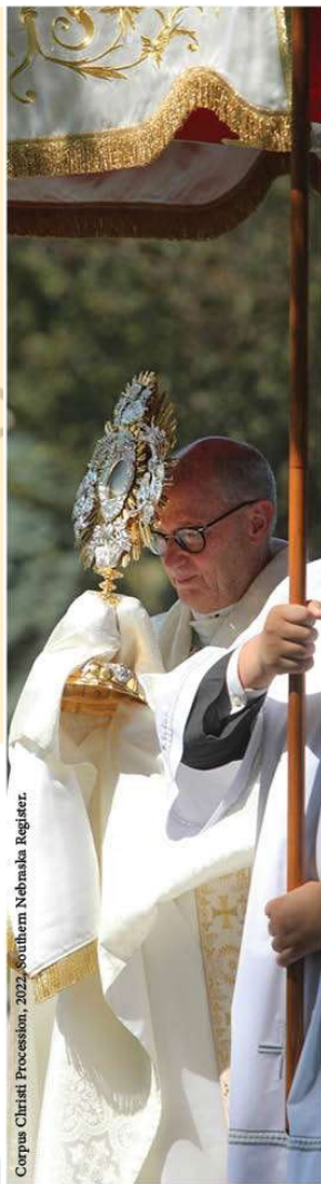
Corpus Christi Procession, 2022, Southern Nebraska Register.