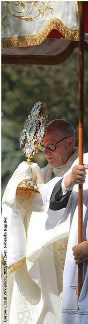
Corpus Christi Procession, 2022, Southern Nebraska Register.