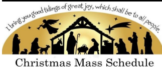
Christmas Mass Schedule