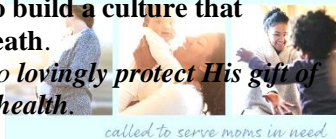
called to serve moms in need

–May God grant us the wisdom & courage to lovingly protect His gift of human life at every stage, in sickness & in health.